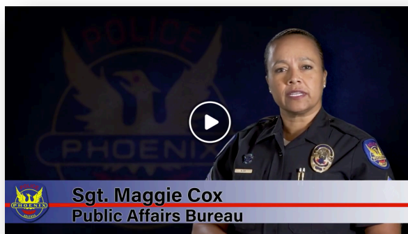
Still image of PPD Public Relations video re: August 9, 2020 arrests